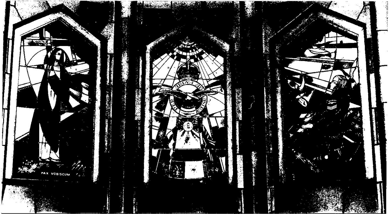
THE CENTRAL WINDOWS OF THE MEMORIAL